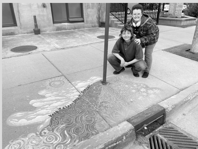
A painted storm drain reminds us of what goes down the storm drain ends up untreated in the rivers and lakes in our community.