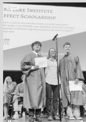
WLI honored four scholarship recipients from WHS and CFHS. Each student received $500 toward college tuition.