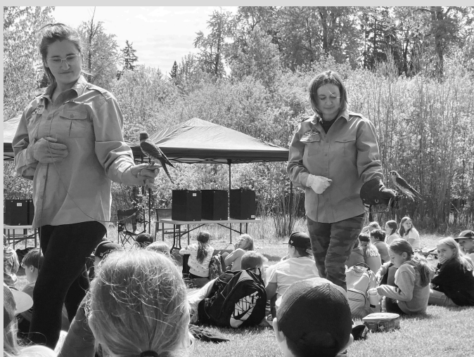
Montana Wild Wings Recovery Center captured the attention of 5 th grade students by providing interesting facts about raptor species.