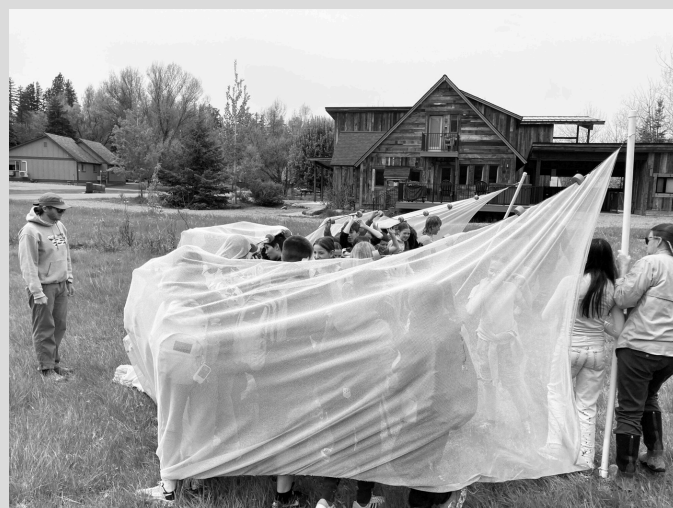
Students get “caught” in the FWP fish nets and learn about techniques FWP uses to answer questions about native fish species.