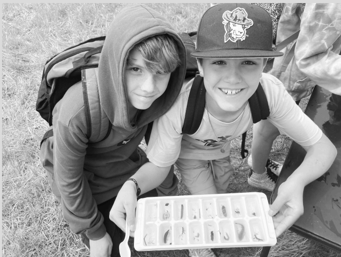
Kalispell and Whitefish 5 th grade students had the chance to sort macroinvertebrates during the annual Viking Creek wetlands education days.