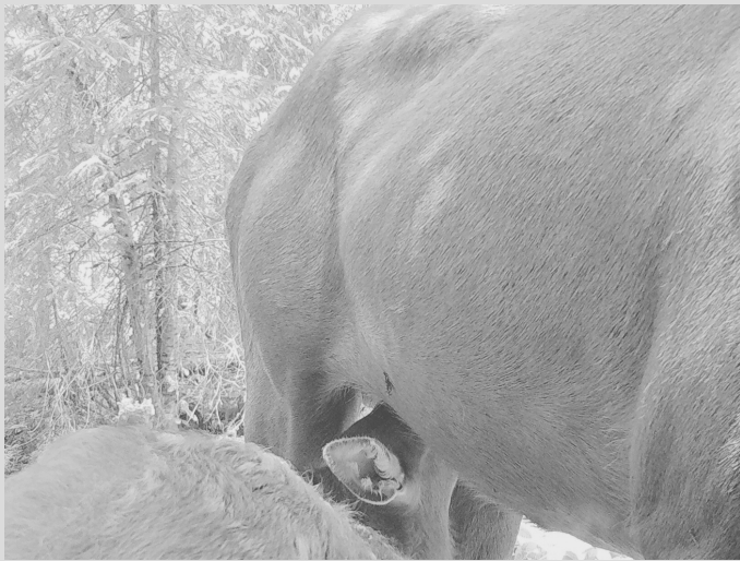
A calf elk nurses in the dense cover of the wetlands. The area has proven to be important rearing habitat for elk.