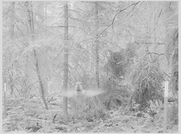
A hummingbird seems intrigued with the trail camera. We also got a good photo of a pileated woodpecker.