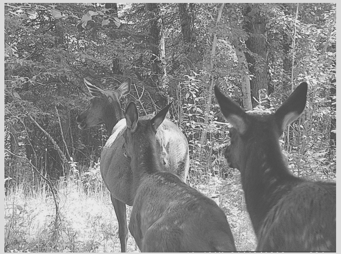
A cow elk and her two calves are on alert as they travel through the wetlands.