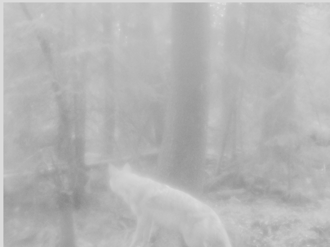
A coyote in the wetlands on a misty morning. Other predators in the wetlands include: fox, mountain lions, black and grizzly bears.