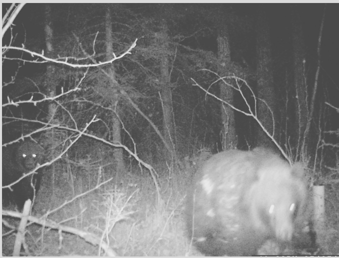
A pair of grizzly bears make their way through the wetlands under the cover of darkness.