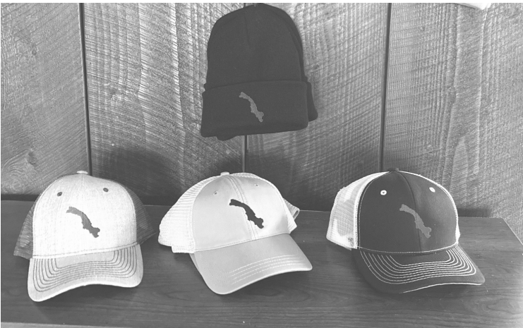
Visit the Whitefish Lake Institute office to buy Whitefish Lake ball caps or winter stocking caps.