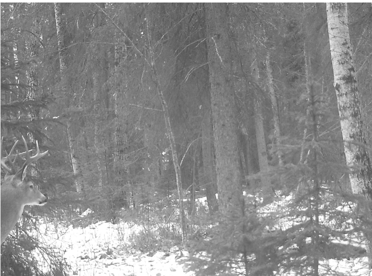
A white-tail buck surveys the forest looking for a mate during breeding season. The trail cameras are always full of deer photos.