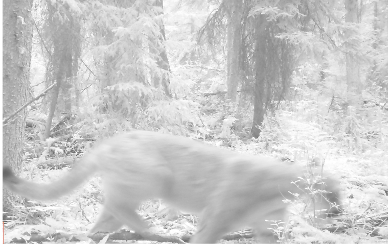
A mountain lion is captured moving swiftly through the preserve. These felines have excellent hearing and vision.