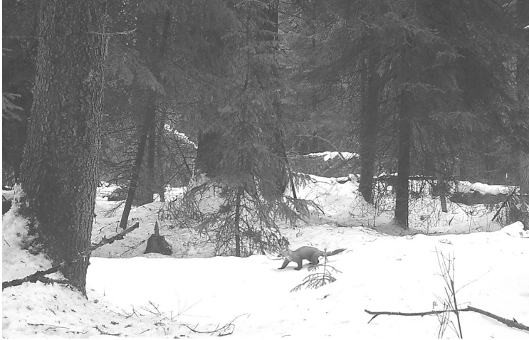
Pine martens are skilled climbers but seen here hunting on the ground for rodents. They also eat fruits and insects.

The trail cameras in the Averill's Viking Creek Wetland Preserve continue to demonstrate the importance of protecting this area in the wildland-urban interface. The area is rich in biodiversity with many species using the wetland habitat the entire year.