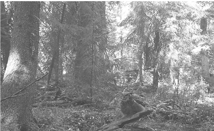
Great horned owls are rarely seen due to their nocturnal habits and excellent camouflage. Their short wide wing span allow them to maneuver among the trees of the forest.