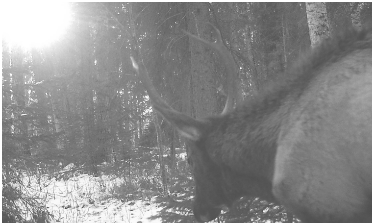
Elk are typically seen grazing in large open meadows, but this young bull elk is seen browsing on shrubs and other plants in the preserve's mixed coniferous forest.