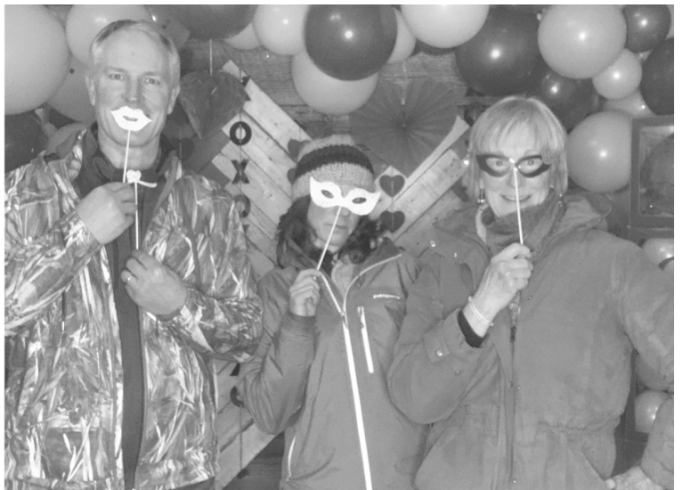
In preparation for the Montana Lakes Conference, WLI staff conducted a walk through at The Lodge at Whitefish Lake. They stopped for an official staff photo at the Valentine's Day photo booth!