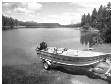
Lower Stillwater Lake.

With continual efforts by our current and future volunteers, the program will continue to grow and be