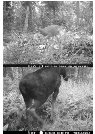
A whitetail buck and a cow moose make their way through the wetlands.

Restoration efforts next year will focus on protecting additional native shrubs and weed control in wooded areas. Look for community weed pulling parties in the future to help restore and maintain the property.