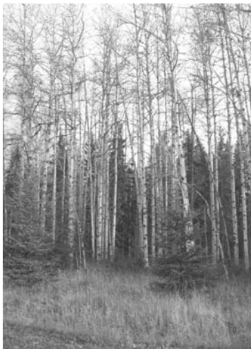
Proposed S.E. trailhead into the wetlands where the trail will lead into a mature aspen stand.

Phase 2 of the trail development will occur next fall after proceeds from the Whitefish Wine Auction will go towards finishing the trail, two bridges and an elevated boardwalk segment. In addition, the interpretive signage will be developed and installed. The trail "grand-opening" will occur in the spring of 2011.