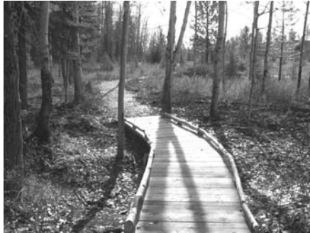
Bridge crossing over a swale.

Phase 1 of the interpretive nature trail that highlights unique aspects of the area has been completed. The trail network has been designed to give the user a unique experience in "the woods" while not encroaching too far into the area where wildlife would be disturbed. Special thanks to Forestration of Whitefish for their professionalism in constructing Phase 1.