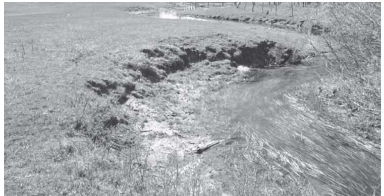
WLI is partnering with the Flathead Conservation District, Soil and Water Conservation Districts of Montana, Montana Department of Environmental Quality, and Montana Fish, Wildlife, & Parks on the Cow Creek restoration project scheduled to begin this fall. WLI will keep you posted on this project in future issues of LakeFront.