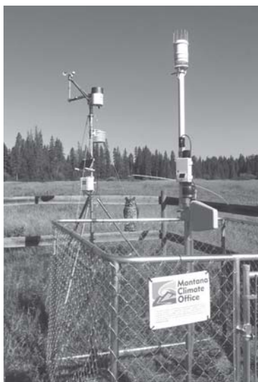
The new Mesonet station near Lazy Bay.

( con't from Page 1... ) cellular communication and are delivered in multiple formats such as maps and graphs that dynamically report the latest content. This includes the ability to rapidly summarize point and gridded data by state, county, watershed or ownership unit. Because no one entity can ensure sustained operation and success of a statewide climate and soil moisture information network, the MCO embraces a cooperative context that addresses a diverse set of information needs. Participants are extended a significant cost reduction on science grade stations and the MCO ensures that data collected are quality controlled and accessible in real time through web services and smart devices. An annual service fee covers data transmission fees, computing infrastructure, and maintenance costs. The MCO will not profit from the stations or maintenance of the network beyond the inherent value in facilitating an expansive and publically available soil moisture and climate information network.