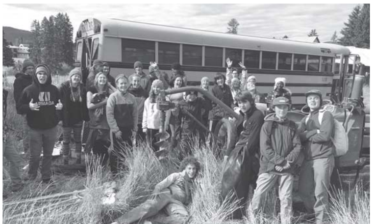
Project FREEFLOW students pause for a photo after a successful day of collecting data in the field.