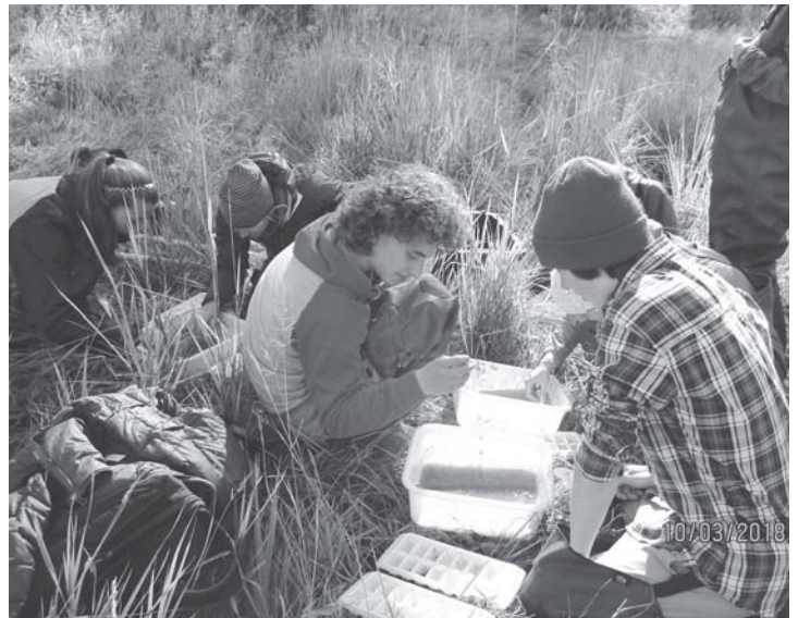
WLI is partnering with the Flathead Conservation District, Soil and Water Conservation Districts of Montana, Montana Department of Environmental Quality, and Montana Fish, Wildlife, & Parks on the Cow Creek restoration project. Project Partners hosted the Whitefish School District Project FREEFLOW to survey the two reaches scheduled for restoration.