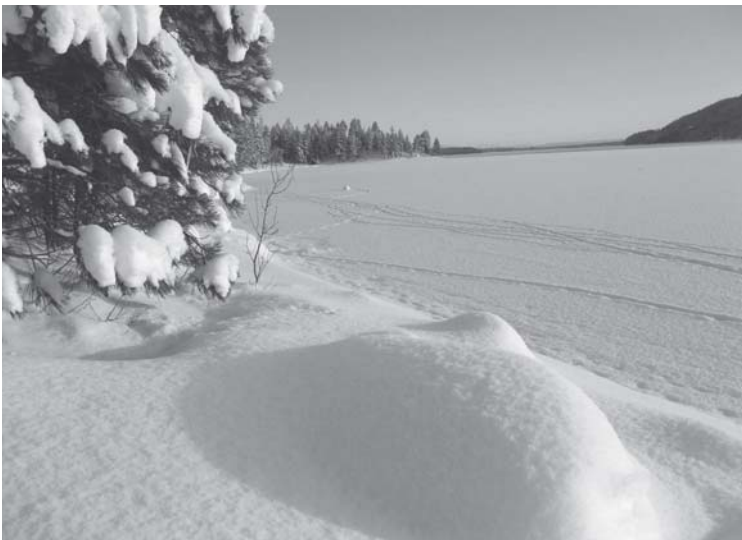
Winter tracks on Whitefish Lake.