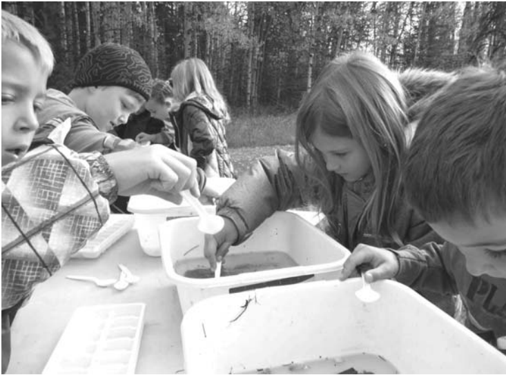
Second graders search for aquatic insects at the Creston Park Trailhead to the Averill's Viking Creek Wetland Preserve.