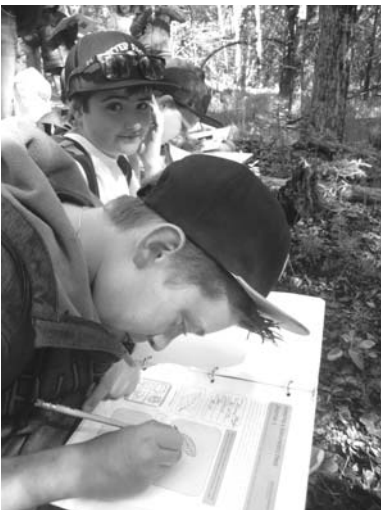
Fifth graders engage in "field journaling."

"Passion is lifted from the earth itself by the muddy hands of the young; it travels along grass-stained sleeves to the heart. If we are going to save... the environment, we must also save an endangered indicator species: the child in nature."