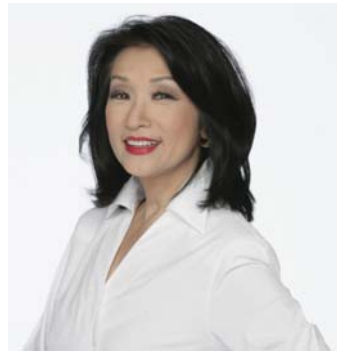
Master of Ceremonies Connie Chung

Friday, July 17 th will be a very special celebratory Whitefish Wine Auction and the Whitefish Lake Institute's Ten Year Anniversary Gala. We are most excited to announce that the extraordinary, history making TV journalist Connie Chung will be the Master of Ceremonies for this year's event!