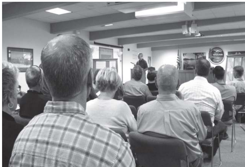
The Whitefish Area Water Resources Community Forum was well attended where valuable public input was gained.

On May 20 th , the City of Whitefish, lead contractor Anderson-Montgomery Consulting Engineers, and report researcher and drafter—WLI held a community forum and an open comment period to gather concerns and thoughts through a survey from individuals in the area covered by the report. Results of the survey will be included in the report. The final report will be delivered at the end of 2015, and a public-friendly report will be available to the public in Quarter 1 of 2016.