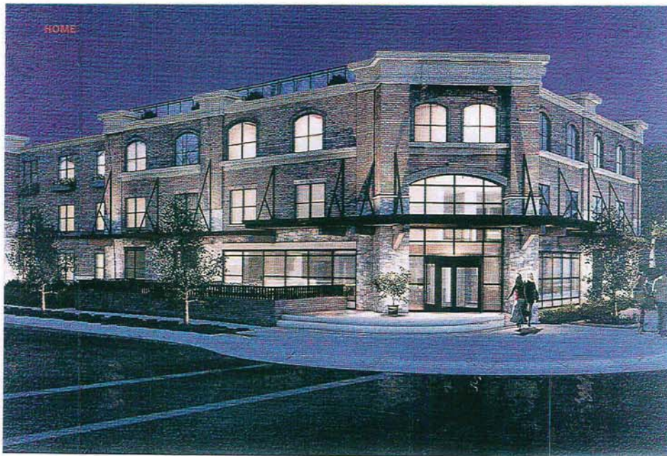
ABOVE A rendering of a proposed boutique hotel in downtown Whitefish.

Sean Averill's big year kicks off with a busy spring, as he begins moving dirt on two major development projects in Whitefish: a 62-lot subdivision and an 89-room downtown hotel. His third proposal, an apartment complex, may be waiting in the wings.